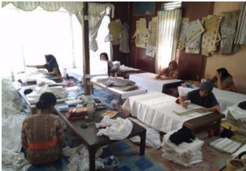
Figure 3. The activity of artisan drawing Sasirangan fabric patterns