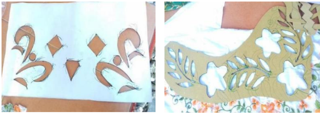
Figure 2. Sasirangan fabric patterns